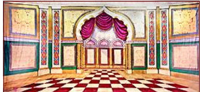
24-I. Moorish Palace

Stalactites and stalagmites from columns, left and right, which lead to center. Opening is approximately 18'H x 20'W.