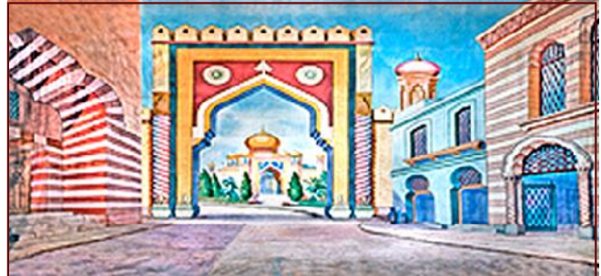
27-C. Arabian Street

Sky and clouds showing sand, rocks, oasis, and palms.