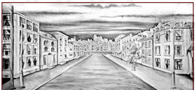
75-B. Old Time Street 43' x 21' - 42 lbs Black-and-white charcoal sketch looking up city street, lined with brick and stone buildings.

Reproduction without permission is strictly prohibited. Images are intended for reference use only. Due to variations in monitors and printers, accurate color representation is neither implied nor guaranteed.