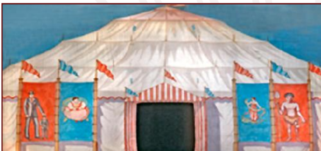
23. Side Show 38' x 20'6" - 28 lbs Tent entrance with practical center door. Opening is approximately 9' W x 9' H.