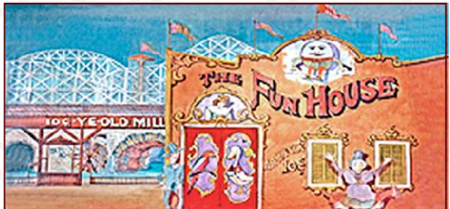
21. Amusement Park 34' x 21' - 30 lbs Features fun house and roller coaster.