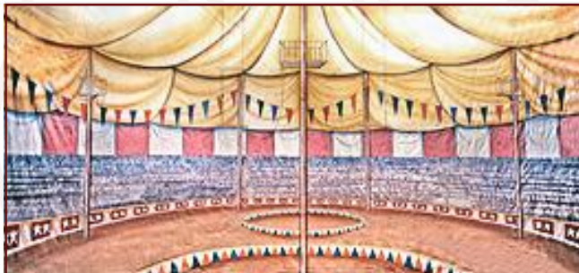
12-ID. Circus 43' x 21' - 38 lbs Similar to 12-IC, with stands and people.