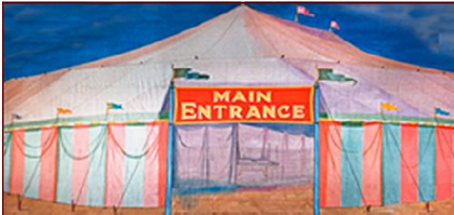
10-B. Circus Main Entrance 39' x 21' - 28 lbs Big Top with entrance sign, featuring practical center opening.