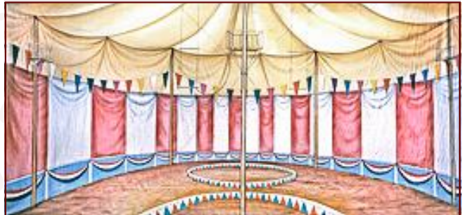
12-IC. Circus 43' x 21' - 37 lbs Tent interior with red and white panels, tan canvas roof, multicolored flags.