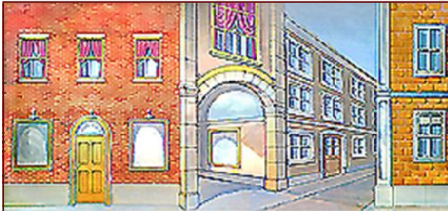
49. Stage Door Street 43' x 20' - 33 lbs Alley and corner of building showing stage door entrance. Front door opening.