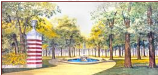
58. Park & Fountain 38' x 20' - 30 lbs Tree-lined park with center fountain, sidewalk, gatepost with flower urn.