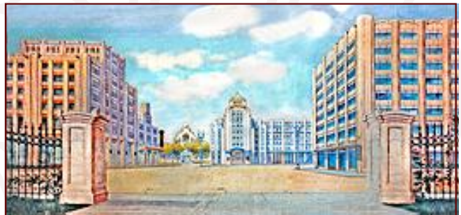
55. City Street 35' x 19'6" - 25 lbs Circa 1940's. Building surrounding downtown intersection.

We would be happy to recommend a selection of backdrops that meet your specific needs!