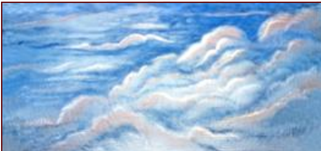
97-B. Sky & Clouds 43'4" x 20' - 32 lbs Altocumulus clouds on a blue background.