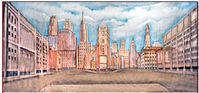
26-E. New York Times Square 43' x 20' - 35 lbs Turn of the century view of Times Square.

We would be happy to recommend a selection of backdrops that meet your specific needs!