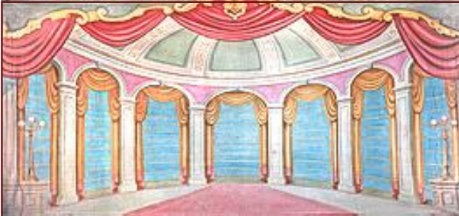
11-I. Night Club or Ballroom 38' x 21' - 32 lbs Elegantly decorated room with arches, draperies, red carpet and bunting.