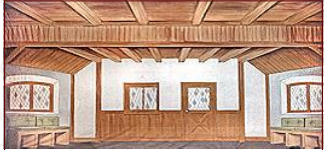
26-IAB. Cottage Inn

Night sky with cirrus clouds and stars painted on dark blue duvetyne.