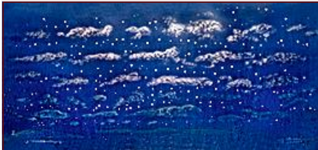
6-MA. Night Sky