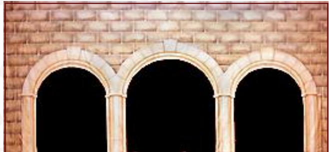
35-I. Stone Arch 41' x 21' - 42 lbs Three practical arched openings, stone block wall, center arch 16' high, left and right arches 14' high.