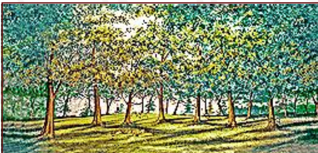
73-EE. Woods 43' x 21' - 40 lbs Clearing in a woods which is surrounded by tree trunks and dense top foliage.