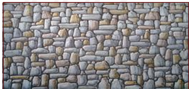
104-E. Stone Wall 30' x 16' - 29 lbs Stone wall painted on muslin.

All images Copyright © 2015 Schell Scenic Studio, Inc. Any reproduction without permission is strictly prohibited. Images are intended for reference only. Due to the variations in monitors and printers, accurate color representation is neither implied or guaranteed.