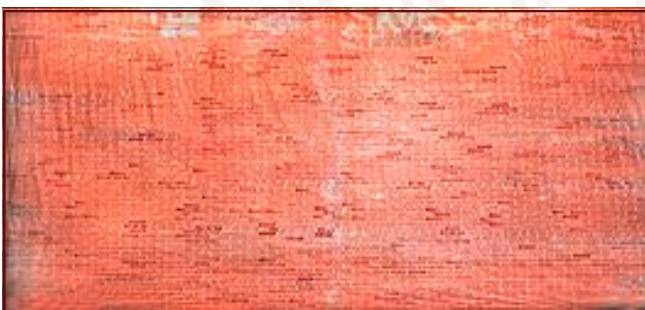
104. Brick Wall 43' x 22'6" - 37 lbs Brick wall painted on muslin.

Our friendly staff is here to help you find the backdrop you need for your next production.