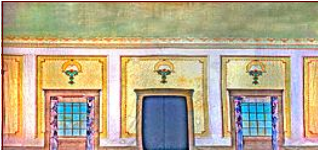
16-I. Bedroom or Living Room 39' x 19' - 30 lbs A practical center door and two painted windows.