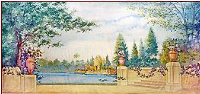
53. Garden 38' x 21' - 40 lbs Formal garden with stone wall, steps, and pool. Buildings in distance.

Can't Find It? Can't find what you need? Just give us a call! Our friendly staff is here to help you find the backdrop you need for your next production.