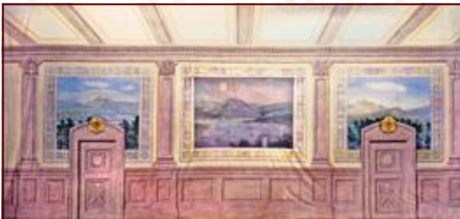
24-IA. Tapestry Interior 39' x 21' - 40 lbs Wood walls with three tapestries and two non-practical doors.

Can't Find It? Can't find what you need? Just give us a call! Our friendly staff is here to help you find the backdrop you need for your next production.