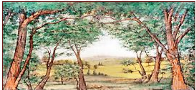
82. Open Woods 37' x 20' - 42 lbs Edge of dense forest looking through to rolling hills in distance.

Any reproduction without permission is strictly prohibited. Images are intended for reference only. Due to the variations in monitors and printers, accurate color representation is neither implied or guaranteed.