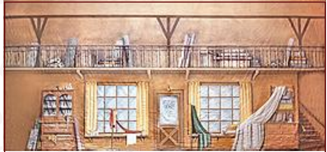
19-IA. Tailor Shop 43' x 20' - 40 lbs Shop with upper balcony filled with bolts of cloth. Lower level with storage cabinets, two windows and door, all non-practical.