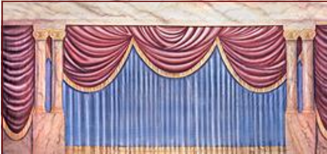
1-IA. Painted Red and Blue Drape 43' x 21' - 43 lbs Austrian puff drape falls behind marble columns.