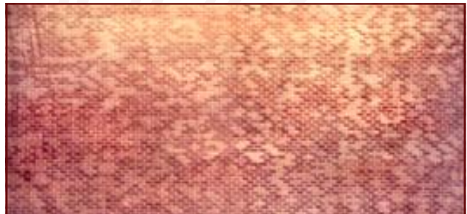
104-B. Brick Wall 43' x 21' - 39 lbs Brick wall painted on muslin.

All images Copyright © 2015 Schell Scenic Studio, Inc. Any reproduction without permission is strictly prohibited. Images are intended for reference only. Due to the variations in monitors and printers, accurate color representation is neither implied or guaranteed.