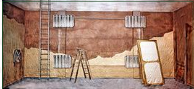
65-I. Backstage 43' x 20' - 37 lbs Backwall of stage showing radiators, ladder, flats and arbor.