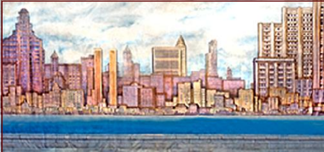
26-BA. New York Skyline 43' x 21' - 35 lbs Skyline of New York as seen from harbor. Low ledge in foreground.