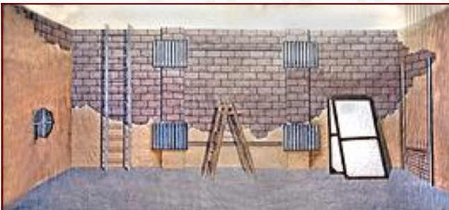
65-IA. Backstage 43' x 20' - 37 lbs Exposed gray block with yellow walls. Arbor stage left.