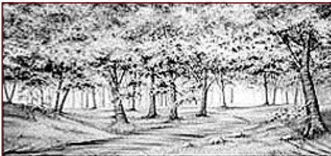
73-CB. Woods Open woods with small clearing in center.

You will find all of that and more at www.schellscenic.com !