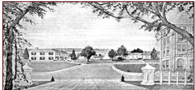
102. Small Town Street or Park Main entrance to park looking down street to houses.