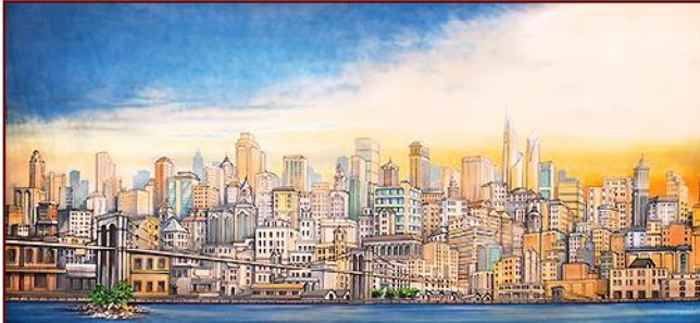
26-AB. New York Skyline 43' x 21' - 40 lbs Stylized view of city skyline from harbor including violent sky.