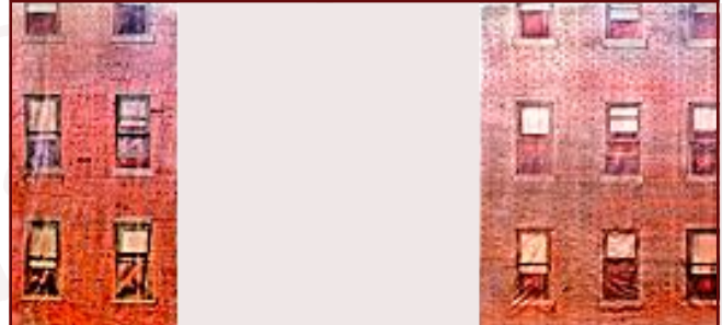
105. Tenement House Side Tabs (see sizes below) (1) 10' x 22'6"; (2) 15' x 22'6" - Set is 29 lbs per pair. Brick houses with non-practical windows.