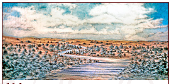
116. Big River 43' x 20' - 39 lbsView of Mississippi River suitable for the "Mark Twain Classic".