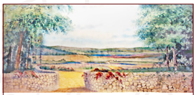
48-C. Irish Landscape 39' x 21 Gently rolling hills are seen over stonewall with gate.