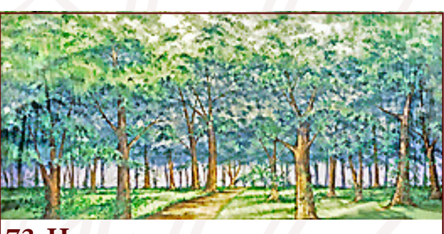
73-H. Woods 43' x 21' - 40 lbs Path crossing left to right through a clearing in a bright forest.