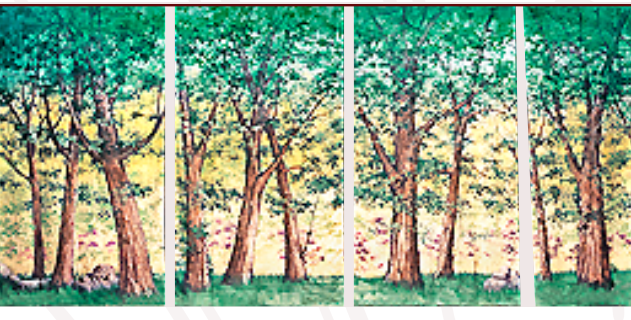
51-AB. Tabs Set Two sets shown.