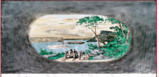
116-A. Big River Scrim View of dock on Mississippi River.