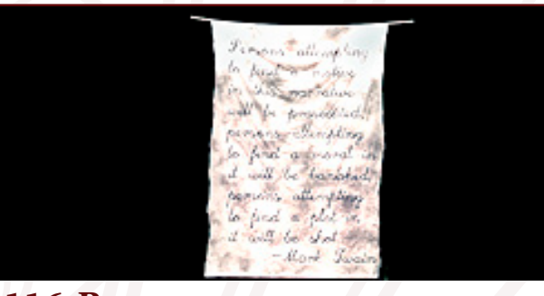
116-B. Big River Scroll 10' x 15' - 9 lbs Scroll containing the dedication to Mark Twain's book, "Huckleberry Finn".