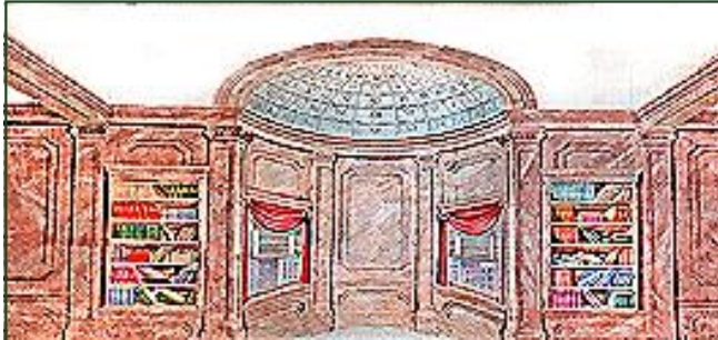
27-IA. Office or Library