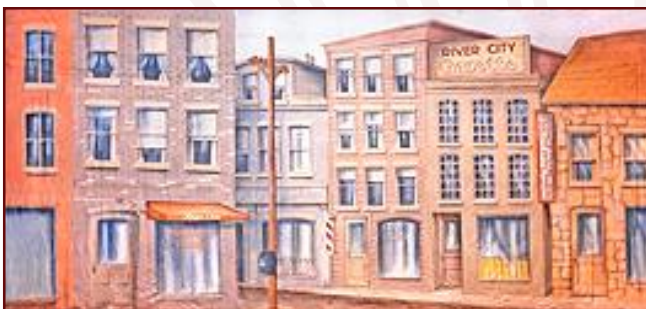
101-A. River City Street

Clearing in a woods which is surrounded by tree trunks and dense top foliage.