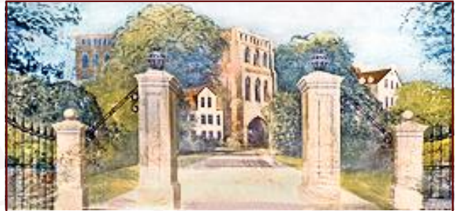
67. College Campus

Give us a call, and let us put a century of industry knowledge to work for you!