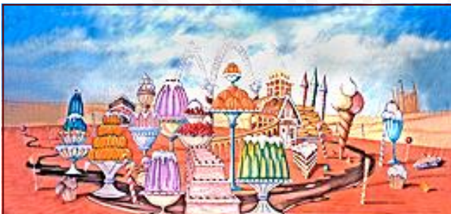
117. Land of Sweets

Path and center gate opening leads past statues and trees to stone building in distance.