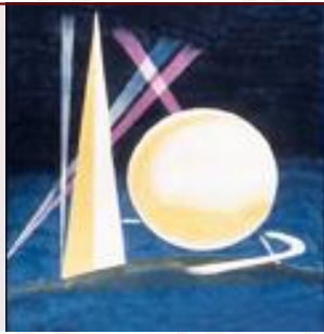
68. World's Fair

Main gates of a typical small town college with four pillars and sidewalk leading to buildings hidden by trees.