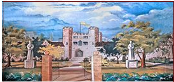
107. College Campus