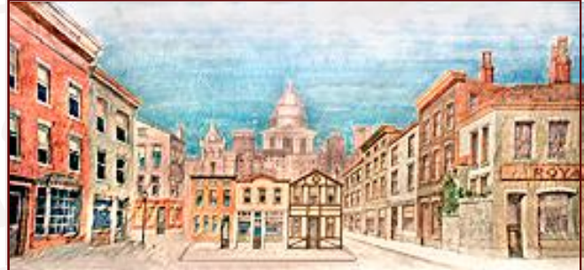
95. London Street Brick and stone houses along a typical London street, with cathedral in background.