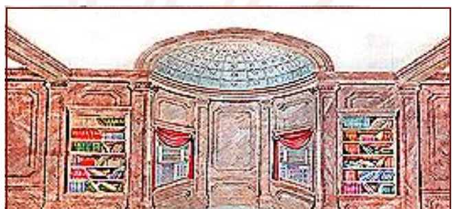
27-IA. Office or Library Windows opened to show outside buildings.