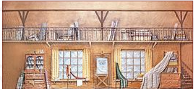
19-IA. Tailor Shop Shop with upper balcony filled with bolts of cloth. Lower level with storage cabinets, two windows and door, all non-practical.