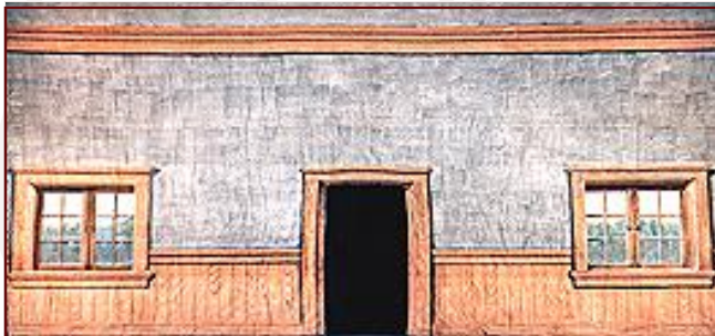
15-I. Plain Interior Practical door opening 3'-0" W x 6'-7" H. Two painted windows (non-practical).