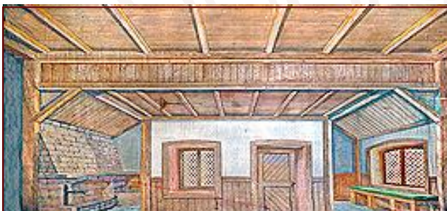
26-I. Old Country Cottage Cottage interior with wood, open beamed ceiling and stone fireplace. Door not practical, two windows.