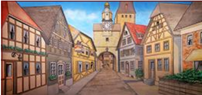
80-A. Bavarian Street Typical medieval German street scene.