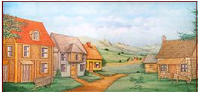
113. Village 43' x 21' - 38 lbs Typical peasant village with thatched-roofed buildings.