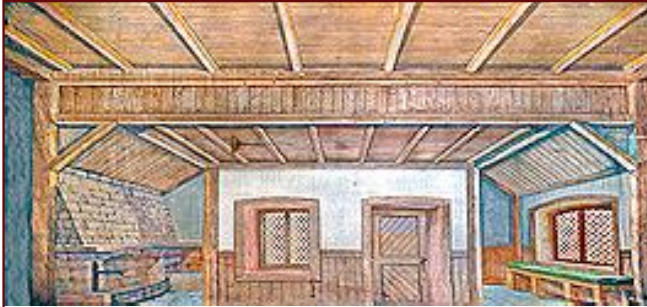
26-I. Old Country Cottage 38' x 21' - 36 lbs Cottage interior with wood, open beamed ceiling and stone fireplace. Door not practical, two windows.