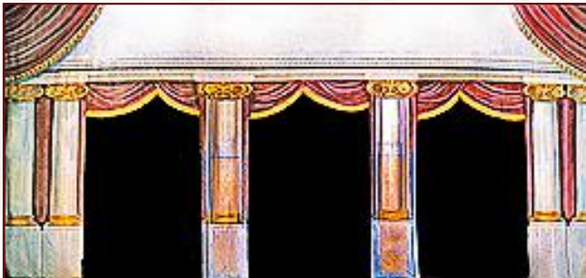
2-I. Palace Leg Drops 38' x 21' - 25 lbs Red Austrian puff drape and white columns divide three arched practical openings.

Did You Know? Did you know that Schell Scenic Studio has been a cornerstone of the theatre community in Columbus, Ohio since 1904? Give us a call, and let us put a century of industry knowledge to work for you!