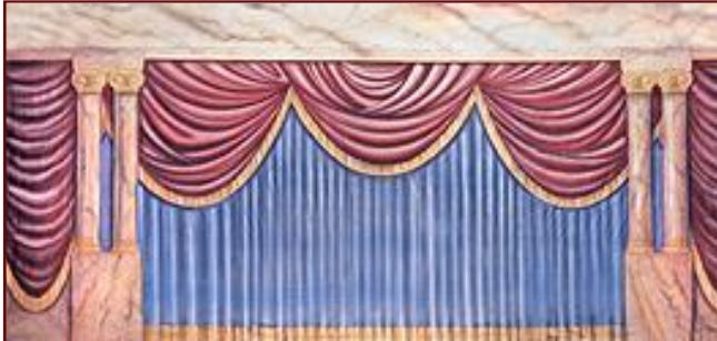
1-IA. Painted Red and Blue Drape 43' x 21' - 43 lbs Austrian puff drape falls behind marble columns.