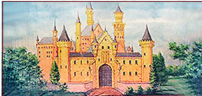
1-G. Charming Castle 43' x 20' - 38 lbs Stone castle.