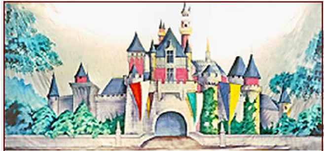
1-F. Story Book Castle 43' x 21' - 36 lbs Stone castle with brightly colored pennants.