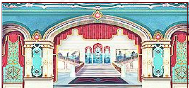
23-IA. Palace 39' x 21' - 30 lbs Ornate palace interior.