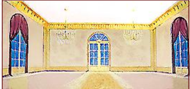
1-IAB. Palace 43' x 21' - 42 lbs Beige walls with chandeliers. Two windows and non-practical door.