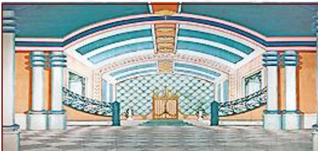
11-IA. Palace or Ballroom 39' x 21' - 37 lbs Columned hall with gated stairway leading to non-practical double doors.

Did You Know? Did you know that Schell Scenic Studio has been a cornerstone of the theatre community in Columbus, Ohio since 1904? Give us a call, and let us put a century of industry knowledge to work for you!