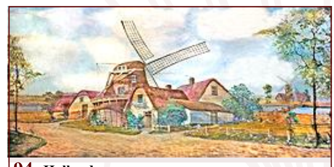
94. Holland 39' x 21' - 32 lbs Dutch cottages with thatched roofs accompany windmills along path, which is lined by wooden fences.