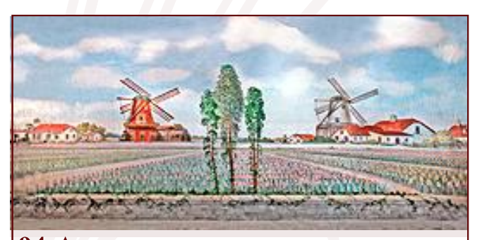
94–A. Holland 40' x 20' - 30 lbs Tulips in fields with a stone wall in foreground, and windmills and thatched-roofed cottages in background.

Any reproduction without permission is strictly prohibited. Images are intended for reference only. Due to the variations in monitors and printers, accurate color representation is neither implied or guaranteed.