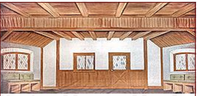
26-IAB. Cottage Inn 39°6" x 19'8" - 32 lbs Cottage interior with wood, open beamed ceiling. Door and three windows not practical.