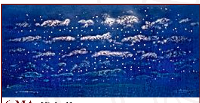
6-MA. Night Sky 40' x 20' - 26 lbs Night sky with cirrus clouds and stars painted on dark blue duvytine.