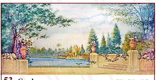
53. Garden 38' x 21' - 40 lbs Formal garden with stone wall, steps, and pool. Buildings in distance.