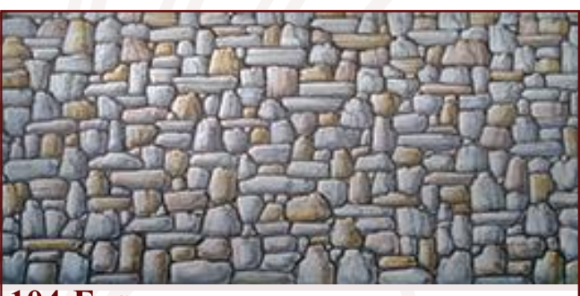
104–E. Stone Wall Stone wall painted on muslin.