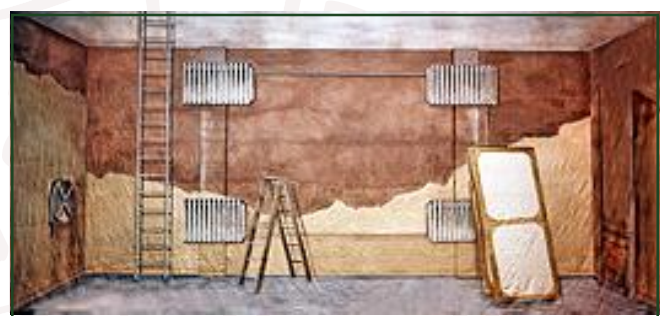
65-I. Backstage 43' x 20' - 37 lbs Backwall of stage showing radiators, ladder, flats and arbor.