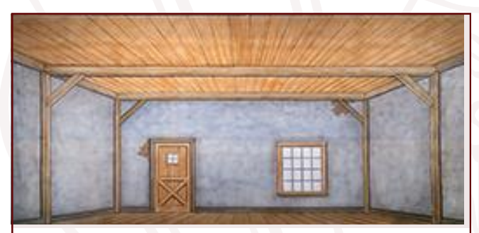
13-I. Rough Interior 39' x 20'6" - 36 lbs Overall gray interior with brown trim showing non-practical door and transparent window.