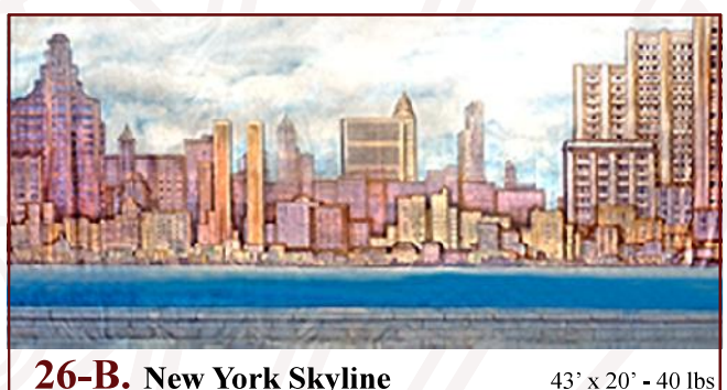
Realistic view of city skyline from harbor.