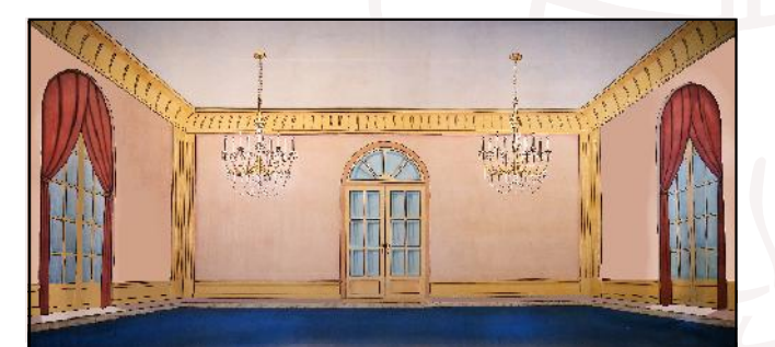
1-IAB. Palace 43' x 21' - 42 lbs Beige walls with chandeliers. Two windows and non-practical door.