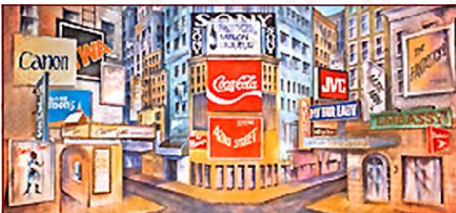
26-C. Times Square N.Y. City 43' x 22' - 40 lbs Modern view of area showing signs, billboards and marquees.