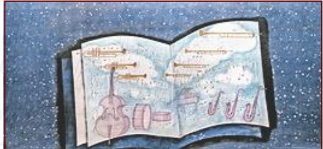
9-M. Sheet Music and Instruments 38' x 21' - 30 lbs Opened musical score on dark blue background with stars, musical instruments and clouds.