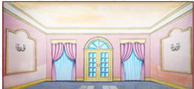
22-IA. Fancy Interior 43' x 21' - 42 lbs Decorative living room with light pink walls, two red draped windows and center french doors. Pinks, gold and blue.