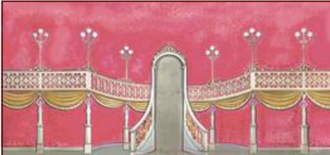
2-IA. Restaurant 43' x 21' - 45 lbs Harmonia Gardens drop with upper balcony and railings and practical center arch. Painted on red crushed velour. Arch 3' x 11'. Height to non-practical balcony is 5'.