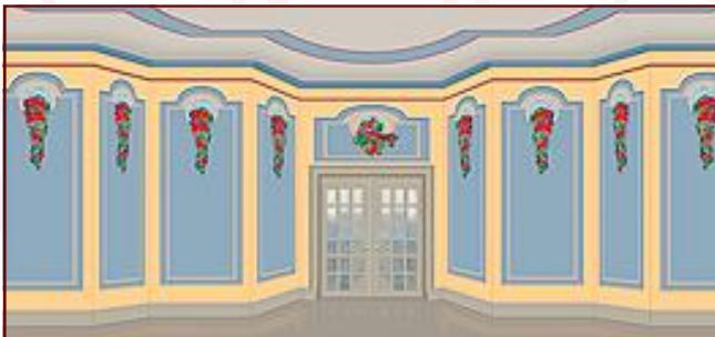
22-I. Fancy Interior 39' x 21' - 36 lbs Decorative living room with center french doors (non-practical).