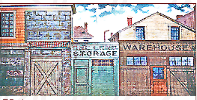
75-A. Slum Street 40' x 21' - 39 lbs Warehouse and storage buildings in a big city alley or easement.