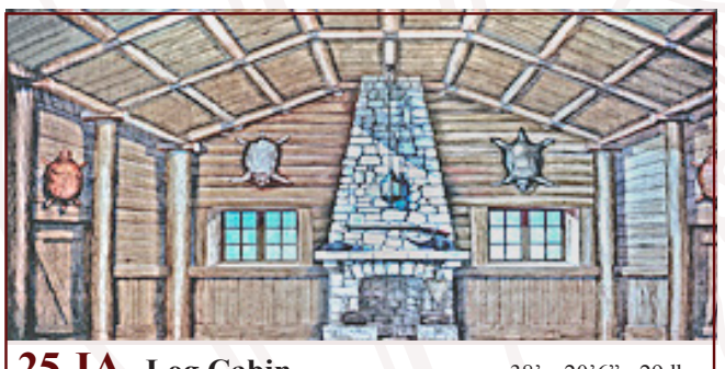
25-IA. Log Cabin 38' x 20'6" - 29 lbs Rustic log interior with stone fireplace and two windows.