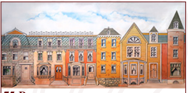
75-D. Victorian Street 43' x 21' - 40 lbs Fronts of Victorian dwellings showing ornate detail, many windows and door entrances.