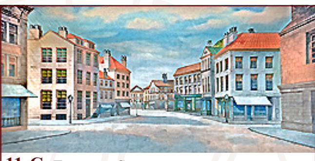
11-C. European Street Stone buildings with tile roofs.

7. Mountain and River 43' x 20' - 40 lbs Valley with fir trees overlooks mountains and river. Path on stage left leads towards river.