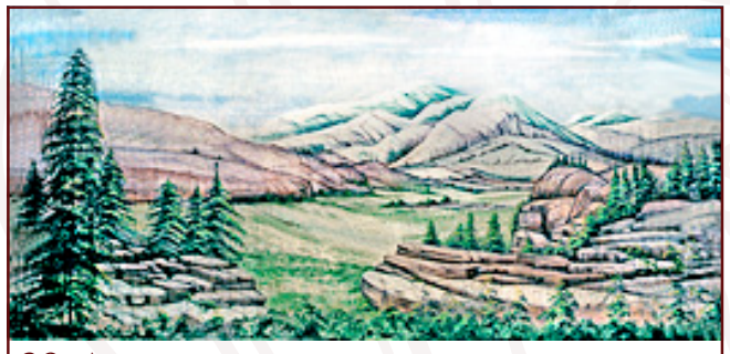
39-A. Rocky Mountain Pass 39' x 21' - 31 lbs Barren snow-capped mountains, pine trees and rocks in foreground.