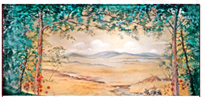
50. Spring Landscape 38' x 18' - 42 lbs A densely forested foreground opens into a rolling meadow with hills in the distance.