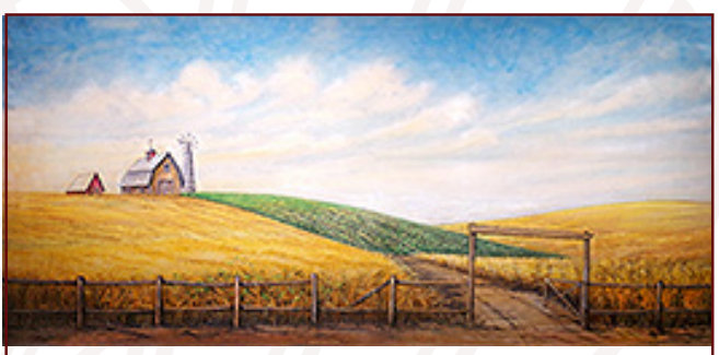
54-AA. Farm Farm with barn in distance, fence in foreground. 43' x 21' - 38 lbs

Our friendly staff is here to help you find the backdrop you need for your next production.