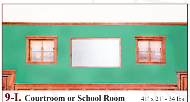
9-1. Courtroom or School Room 41' x 21' - 34 lbs Painted green walls with brown paneling bottom with two windows and two doors (all non-practical).