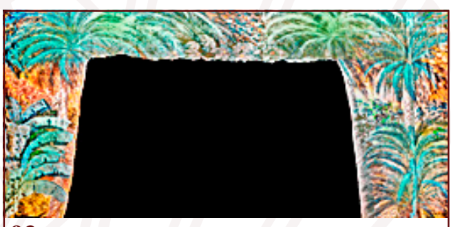
93. Tropical Leg Drops (2 sets) 46' x 21' - 25 lbs (each set) Tropical foliage legs. Border is 6' high, average width of legs is 9', with 30' openings.