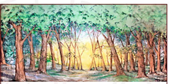
73-F. Woods Bright forest with clearing in center.