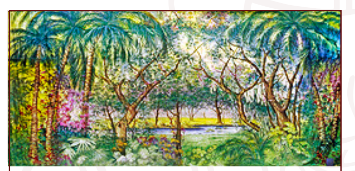
13. Tropical Jungle Dense foliage.