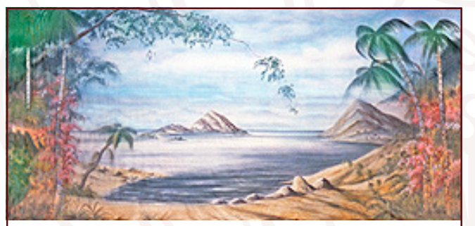
92. Tropical 43' x 20'6" - 45 lbs South Seas island and shoreline looking out into a bay. Mountainous island in the background, and palm trees in foreground.