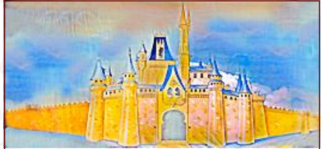
1-E. Fairyland Castle Sandstone castle with moat and center gate. Gate not practical.