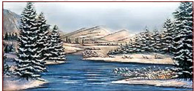
69-C. Winter Snow Scene Ice-covered countryside with snow-covered spruces which line the banks of a lake or stream.