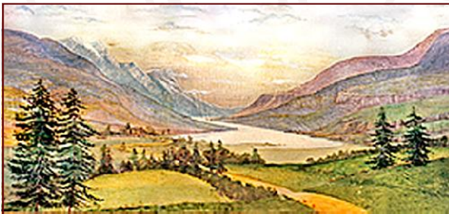
7. Mountain and River Valley with fir trees overlooks mountains and river. Path on stage left leads towards river.