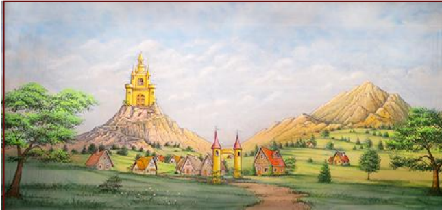
1-AC. Fairyland Castle in distance atop mountain.