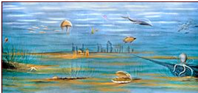
44-B. Bottom of the Sea

Ship deck of typical wooden square-rigger showing mast, riggings and sail, railings and ocean.