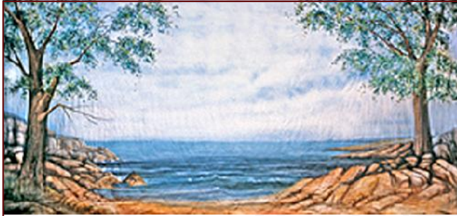
34-D. Ocean & Beach