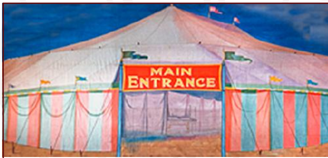
10-B. Circus Main Entrance 39' x 21' - 28 lbs Big Top with entrance sign, featuring practical center opening.