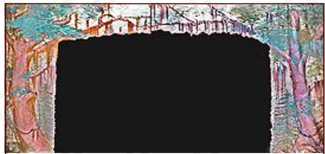
62-B. Southern Foliage Leg & Border 25'x21'-23 lbs Natural southern foliage with Spanish moss. Border overlaps in center for desired opening.