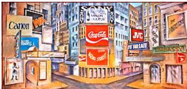
26-C. Times Square N.Y. City 43' x 22' - 40 lbs Modern view of area showing signs, billboards and marquees.

Give us a call, and let us put a century of industry knowledge to work for you!