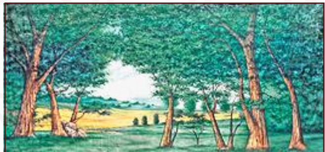
82-B. Open Woods 43' x 21' - 40 lbs Edge of dense forest looking through to rolling hills in distance.