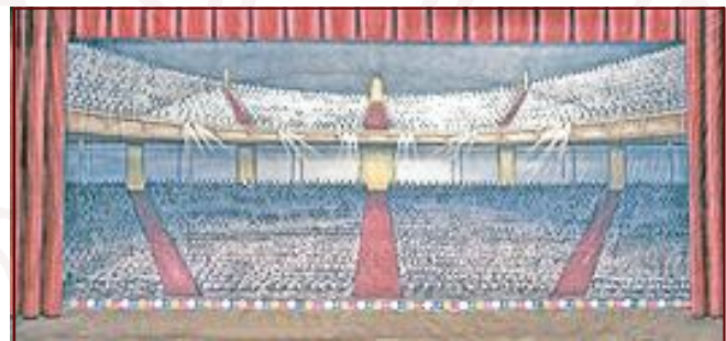
71-I. Theatre Interior

Spring trees in blossom, water and hillside in distance.