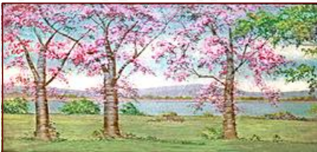
60-BA. Cherry Trees