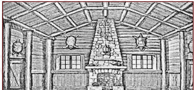
25-IA. Log Cabin 38' x 20'6" - 29 lbs Rustic log interior with stone fireplace and two windows.

Give us a call, and let us put a century of industry knowledge to work for you!