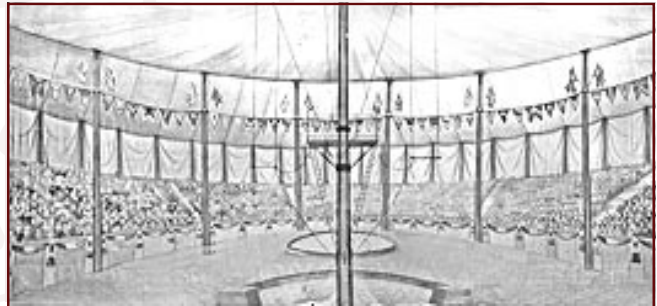
12-I. Circus 39' x 21' - 29 lbs Tent interior with center pole, show rings and multicolored flags.