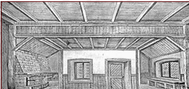
26-I. Old Country Cottage 38' x 21' - 36 lbs Cottage interior with wood, open beamed ceiling and stone fireplace. Door not practical, two windows.