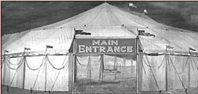
10-B. Circus Main Entrance 39' x 21' - 28 lbs Big Top with entrance sign, featuring practical center opening.