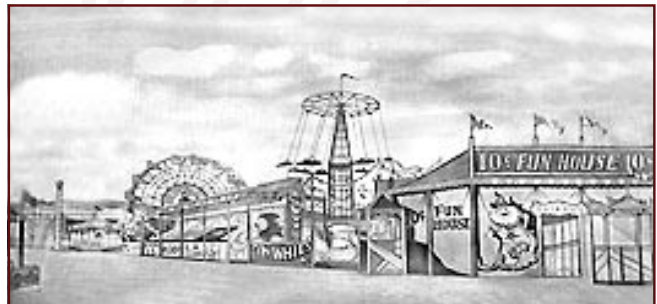
36. Carnival Midway 38' x 21' - 21 lbs Amusement rides, games and funhouse entrance.

All images Copyright © 2007 Schell Scenic Studio, Inc. Reproduction without permission is strictly prohibited. Images are intended for reference only. For color renditions of these backdrops, please visit www.SchellScenic.com to download our catalog.