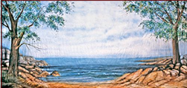
34-D. Ocean & Beach 43' x 21' - 41 lbs Trees and rocks frame a calm sea and cloud-filled sky.