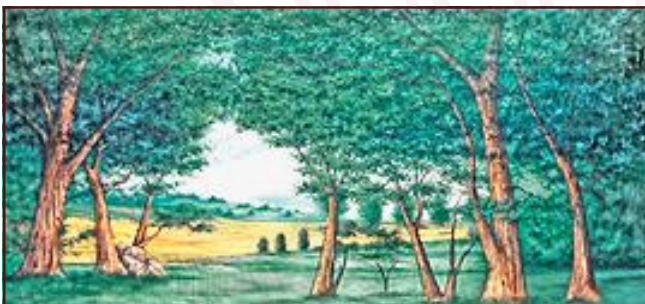
82-B. Open Woods 43' x 21' - 40 lbs Edge of dense forest looking through to rolling hills in distance.