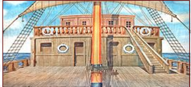
42-C. Sailing Ship 39' x 21' - 34 lbs Ship deck of typical wooden square-rigger showing mast, riggings and sail, railings and ocean.