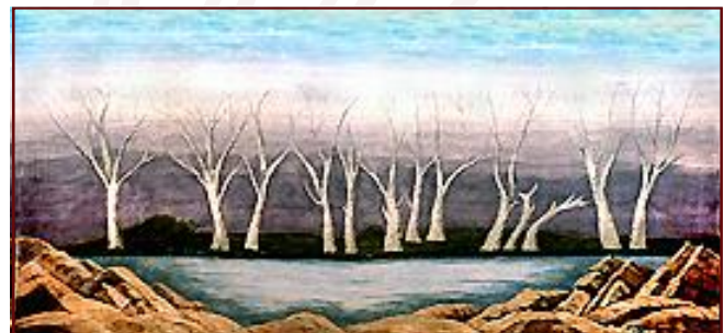
99. Lake Scrim 35' x 19' - 20 lbs Cut opening in center views stalactites and other rock formations left and center. Opening is 20' W x 18' H approx.

All images Copyright ©2005 - 2015 Schell Scenic Studio, Inc. Reproduction without permission is strictly prohibited. Images are intended for reference use only. Due to variations in monitors and printers, accurate color representation is neither implied nor guaranteed. All Images are low resolution, and will become pixelated if viewed above 200% magnification. Higher resolution photos are not available.