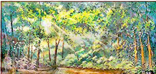
73-A. Woods 30' x 16' - 22 lbs Dense woods with shafts of sunlight piercing through heavy top foliage.