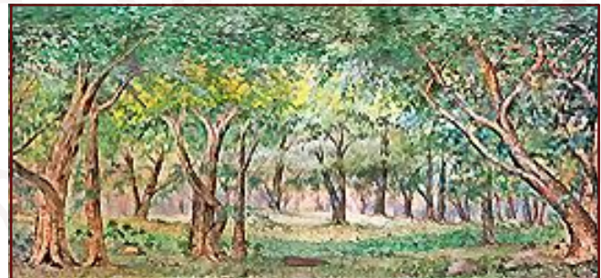
73-D. Woods 43' x 20' - 40 lbs Clearing in a dense forest with heavy top foliage.