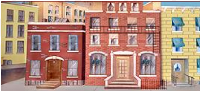
75-C. Tenement Street 43' x 21' - 36 lbs Bright and stone apartment buildings with sidewalk in foreground and additional buildings in distance.

You will find all of that and more at www.schellscenic.com !