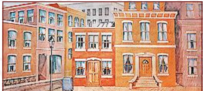
75-E. Tenement Street 43' x 21' - 40 lbs Brick and stone apartment buildings with sidewalk, mailbox, and lamppost on street corner.