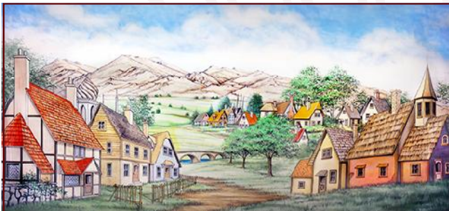
110. Village 40' x 21' - 37 lbs View of small Russian village with buildings and houses in foreground, mountains in distance.