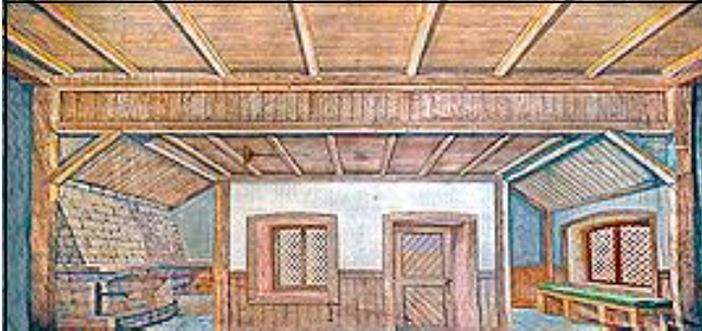
26-I. Old Country Cottage 38' x 21' - 36 lbs Cottage interior with wood, open beamed ceiling and stone fireplace. Door not practical, two windows.