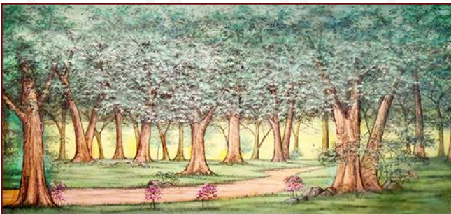
73-B. Woods 38' x 20' - 40 lbs Path crossing left to right through a clearing in a bright forest.