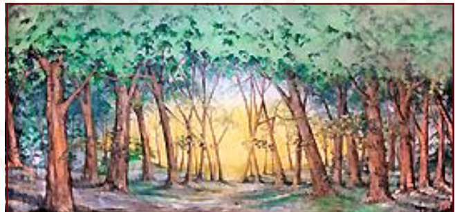
73-F. Woods 43' x 21' - 39 lbs Bright forest with clearing in center.