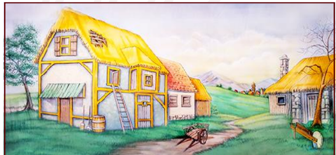
112. Village 43' x 21' - 38 lbs Typical Russian peasant house with thatched-roofed buildings.

All images Copyright ©2005 - 2015 Schell Scenic Studio, Inc. Reproduction without permission is strictly prohibited. Images are intended for reference use only. Due to variations in monitors and printers, accurate color representation is neither implied nor guaranteed. All Images are low resolution, and will become pixelated if viewed above 200% magnification. Higher resolution photos are not available.