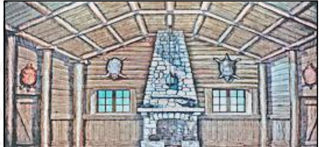
25-IA. Log Cabin 38' x 20'6" - 29 lbs Rustic log interior with stone fireplace and two windows.