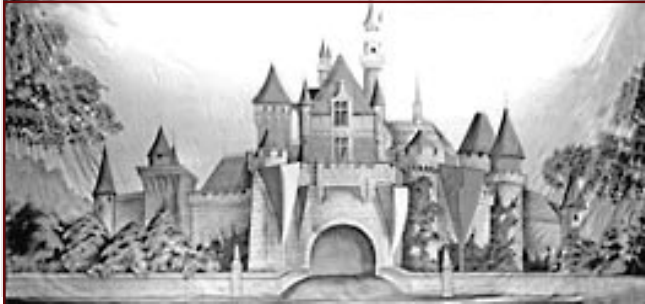
1-F. Story Book Castle Stone castle with brightly colored pennants.