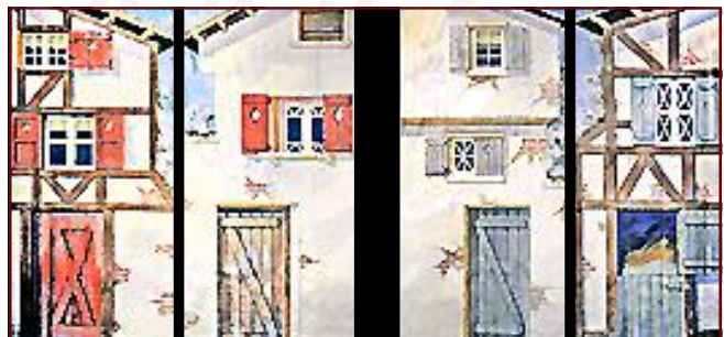
84. Old Country Tabs