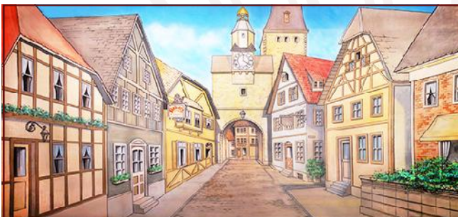
80-A. Bavarian Street

Give us a call, and let us put a century of industry knowledge to work for you!