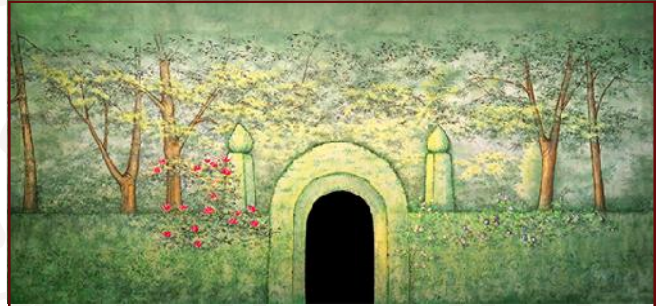
6. Hedge Garden

Beige walls with chandeliers. Two windows and non-practical door.