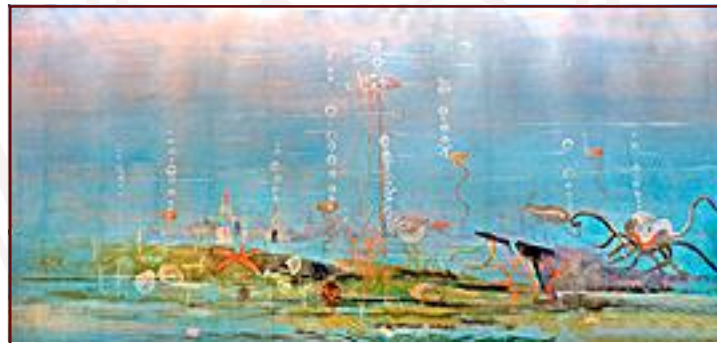
44. Bottom of the Sea