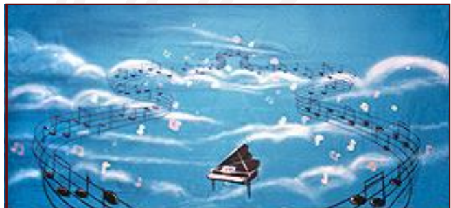
28-M. Musical Scale and Piano

Blue sky with musical staff and notes crossing through clouds and bright sunset in distance.