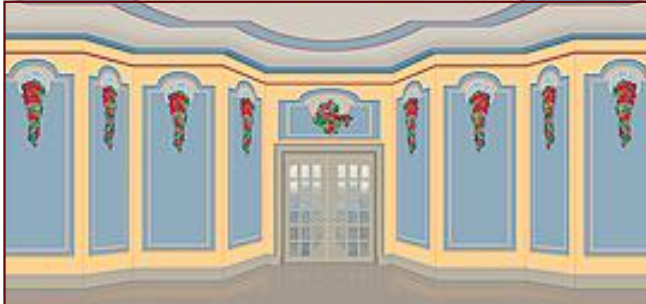
22-I. Fancy Interior