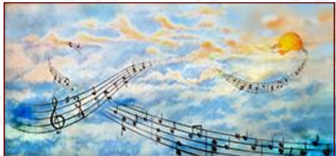
27-M. Music in the Air

Skyline of New York as seen from harbor. Low ledge in foreground.