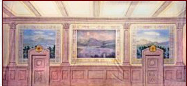
24-IA. Tapestry Interior

Decorative living room with center french doors (non-practical).