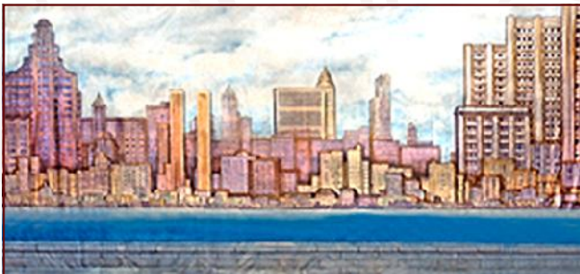
26-BA. New York Skyline

Wood walls with three tapestries and two non-practical doors.