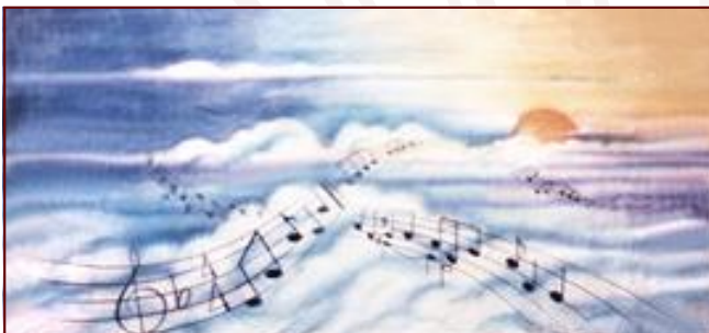
27-MA. Music in the Air

Blue sky with musical staff and notes crossing through clouds and bright sunset in distance. Whites, black, oranges and yellows.