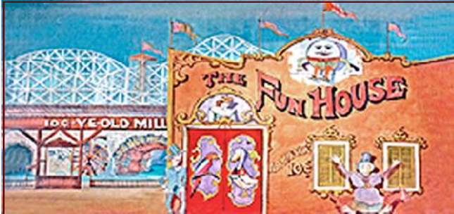
21. Amusement Park