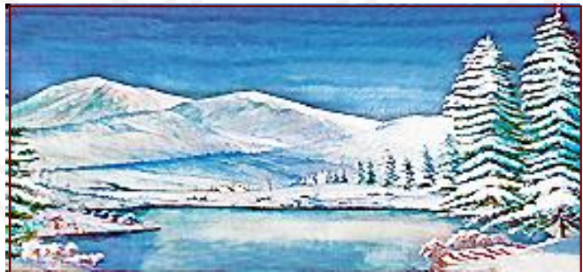
69-B. Winter Scene

Give us a call, and let us put a century of industry knowledge to work for you!