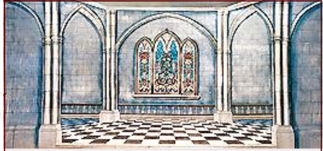
14-I. Church Interior

Columned hall with gated stairway leading to non-practical double doors.