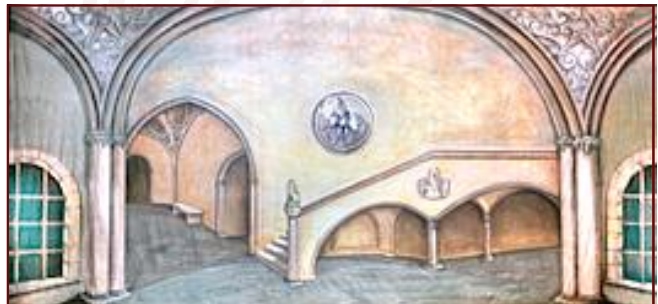
34-I. Castle Interior

Decorative living room with light pink walls, two red draped windows and center french doors. Pinks, gold and blue.