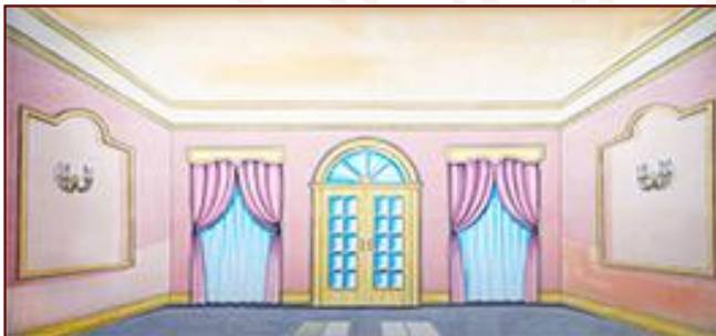
22-IA. Fancy Interior

Stone walls and arches, tile floor with stained glass window in center.