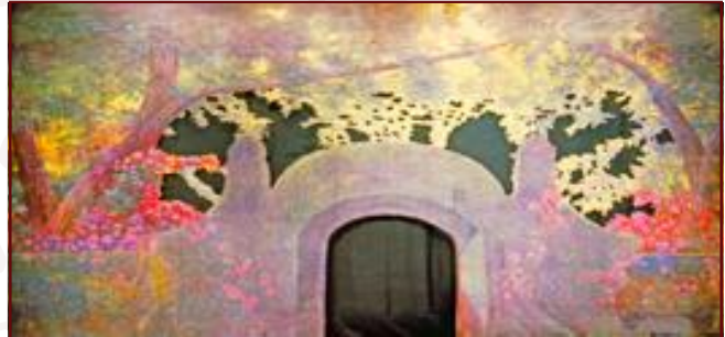
6. Hedge Garden

Formal Garden with pool in foreground and flowers, wall and steps.