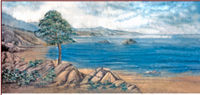
34-A. Bay 43' x 20' - 42 lbs Ocean shoreline with rock-filled beach, boulders and single tree.